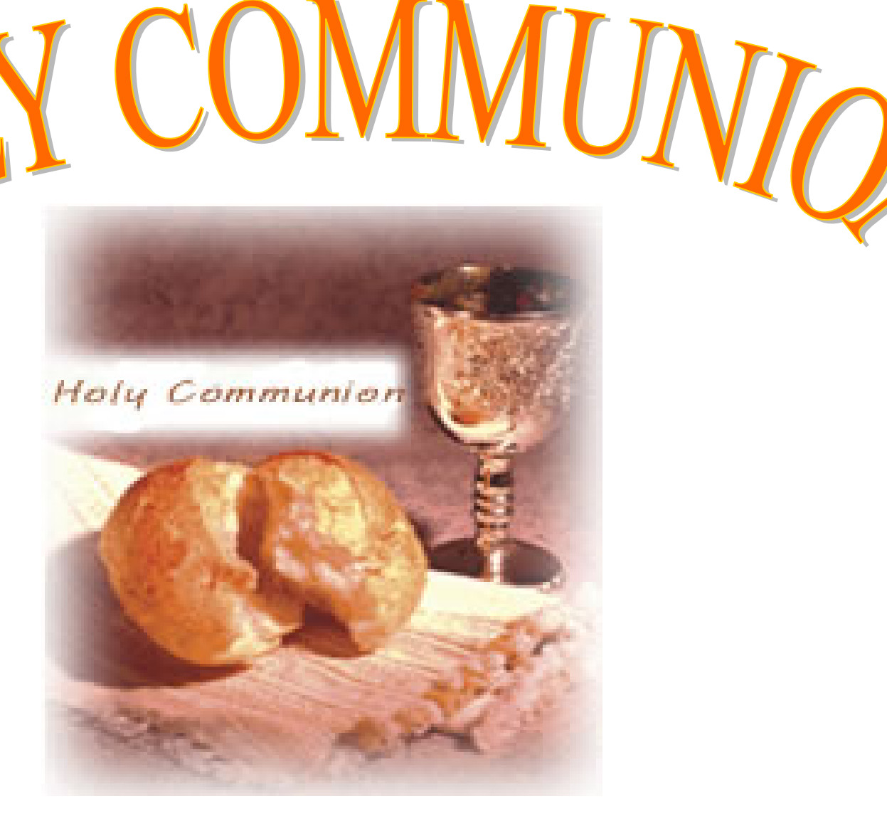
By Chandula Abeywickrema